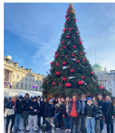
Year 10 at Somerset House