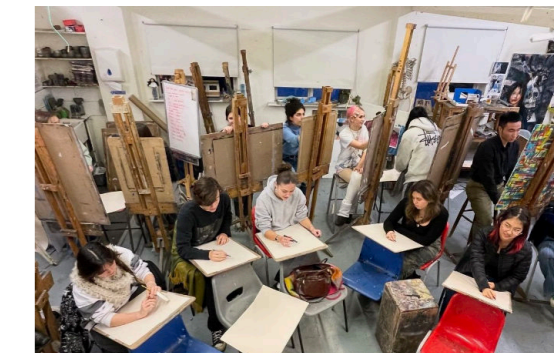
Life Drawing Student Evening Class