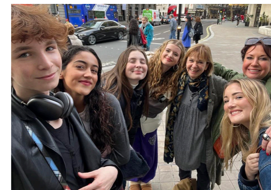
History of Art trip to the Courtauld