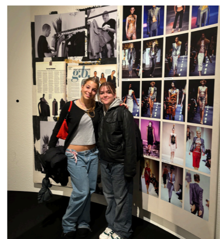
Fashion & Textiles at the Design Museum