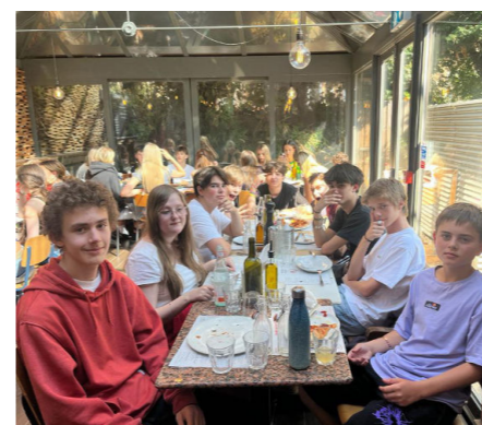
Year 10 Start of Term lunch