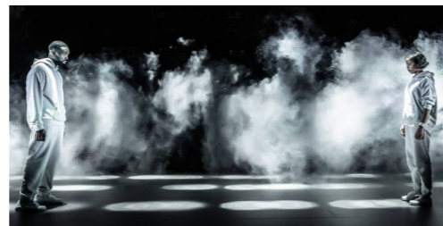
National Theatre: The Effect , by Lucy Prebble – in association with The Jamie Lloyd Company

What sets The Effect apart is its ability to provoke thought on the intersections of love, identity, and the unforeseen consequences of scientific endeavours. The production is a testament to the compelling storytelling and the transformative impact of outstanding performances. From set design to direction, every element contributes to an immersive atmosphere that enhances the emotional resonance of the play.