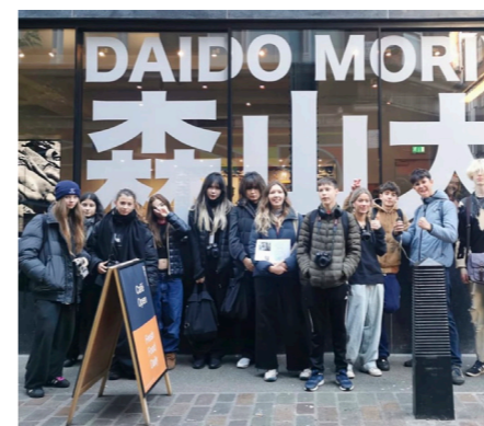
Year 11 at The Photographer's Gallery