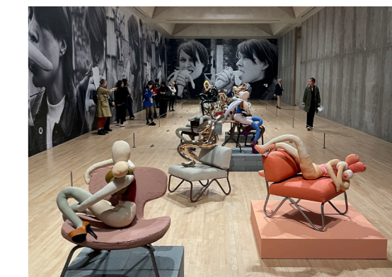
A Level Tate Britain trip