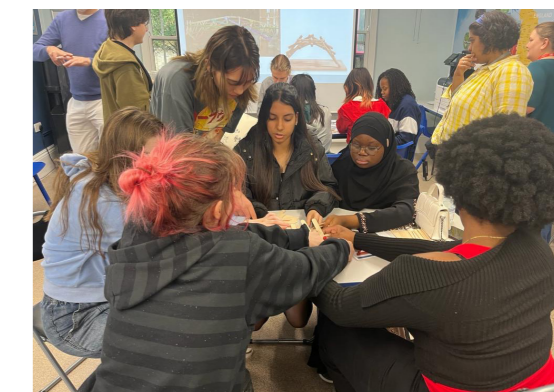
Renaissance Scholars trip